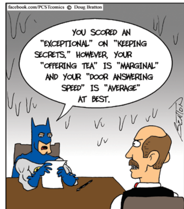
Alfred's Annual Performance Review