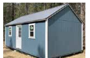
COTTAGES & CABINS

FREE Delivery within 50 miles of Moscow, ID