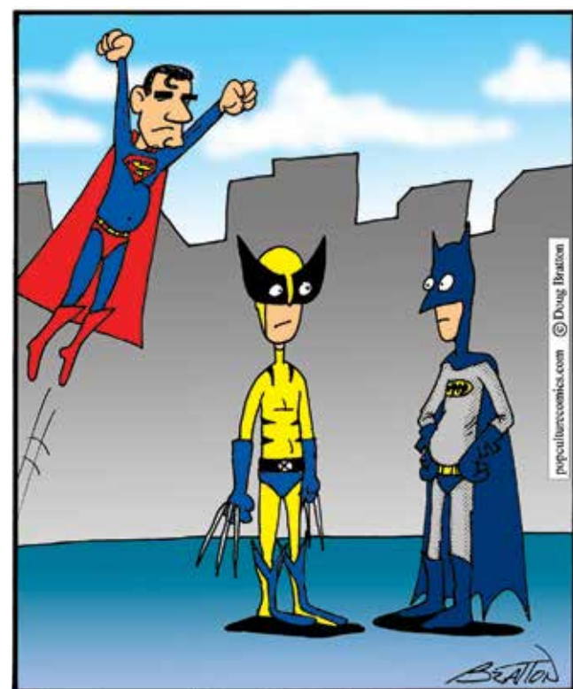
Superheroes, After the Crackdown on Steroids