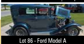
Lot 86 - Ford Model A