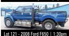
Lot 121 - 2008 Ford F650 | 1:30pm