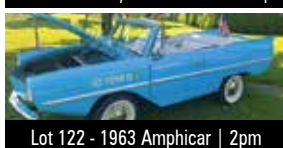
Lot 122 - 1963 Amphicar | 2pm