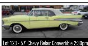
Lot 123 - 57' Chevy Belair Convertible | 2:30pm