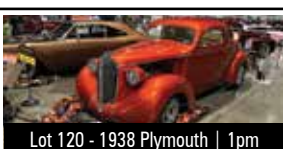
Lot 120 - 1938 Plymouth | 1pm