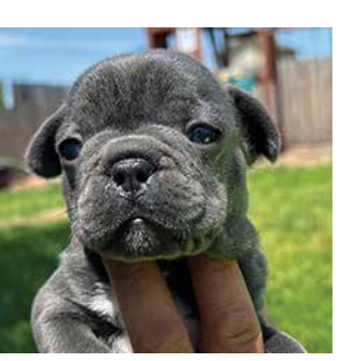
BLUE FRENCHIE PUPPIES

AKC registered, mom & dad on site, first shots & health exam. Three males & two females. Contact for more information, 503-437-0883 Spokane