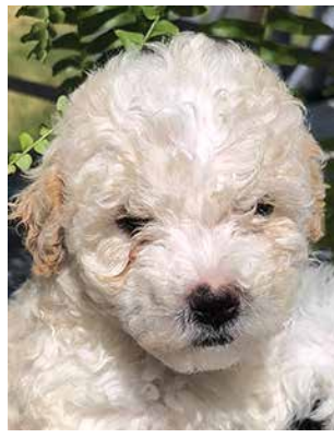
MINI POODLE PUPPIES Males, $700 & females, $800. First shots, de-

Yellow & Black Labrador puppies, purebred (no papers), 5 males & 3 females available, come from very active, social, loyal parents, love to retrieve, will be up-to-date on vaccinations, vet checked, dewormed & socialized, ready June 30, $600 each, taking deposits now. 208-610-4119 Bonners Ferry