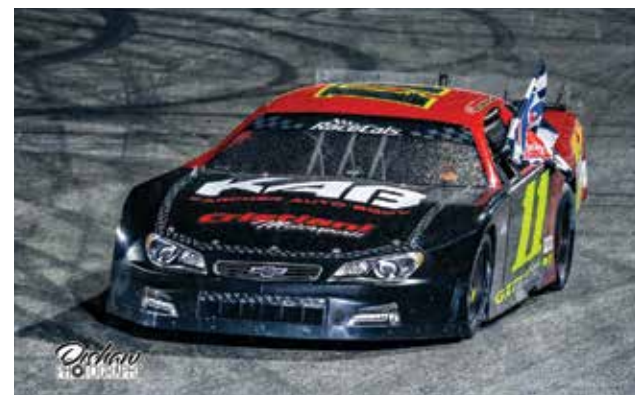
Nick Gibson is the Racecals 2023 champ at Stateline Speedway having won four of six races.