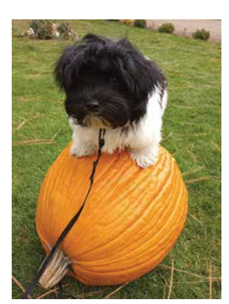
HAVANESE x MALTESE Two males, beautiful black & white coloring, shots & dewclaws done. 509-362-

First shots & wormed, DNA tested parents. Contact us today, Vanessadenham@hotmail.com 208-301-8087