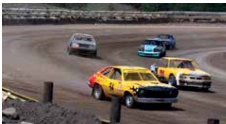
Fever Four class racing at Eagle Track Raceway in Republic.