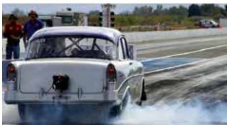
Typical drag racing at Renegade Raceway near Yakima.

Further information is available by visiting renegaderaceway.com .