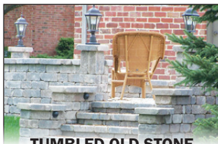
TUMBLLED OLD STONE

Open Monday-Friday 7am-5pm Closed Weekends