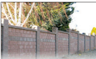
SOUND WALLS & PRIVACY