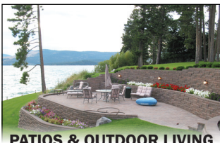
PATIOS & OUTDOOR LIVING