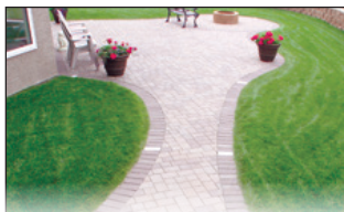
WALKWAYS & ENTRYWAYS